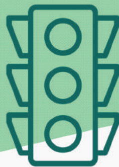
Image detection and analysis generates signals for traffic light controllers that indicate the passage and stay of vehicles over the configured virtual loops.